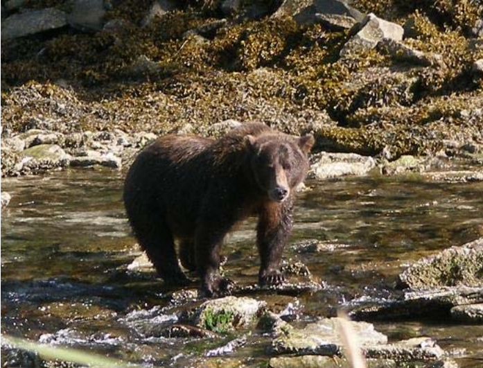
Up Close and Personal in Katmai