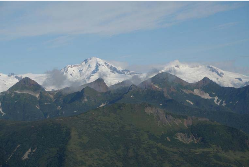
The Mountains of Katmai