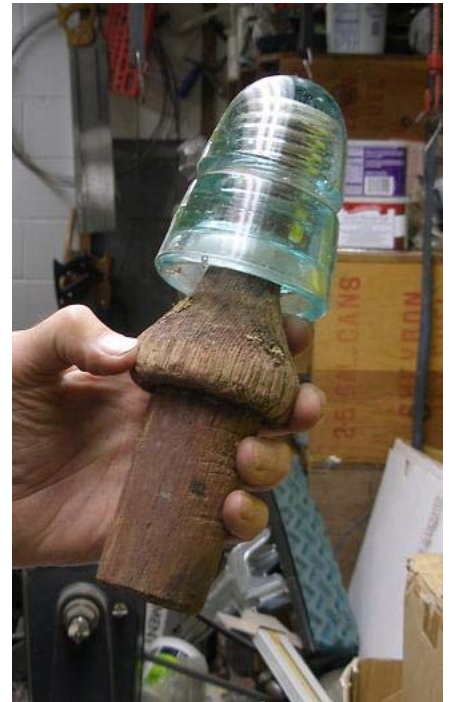
Off the Billy Mitchell Telegraph Line