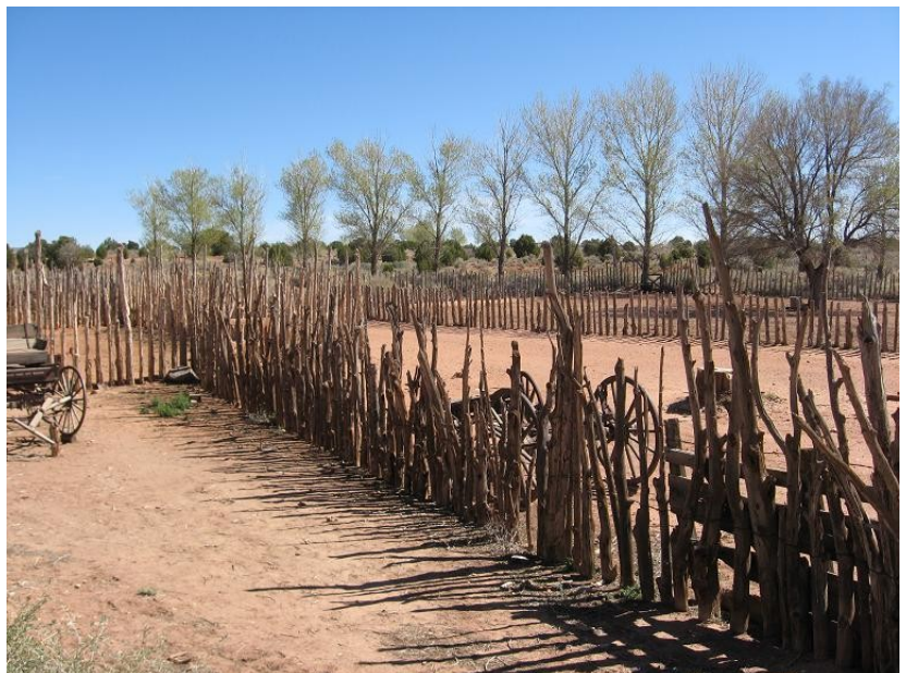
Vertical Pole Corral Fence