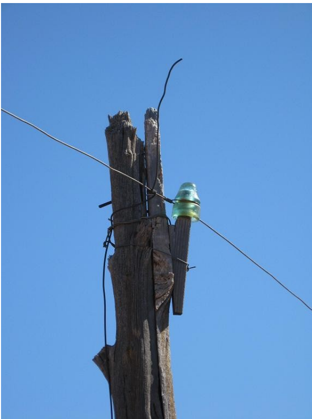
Old Pole Replica with Grounding of the Conductor to Arrest Lightning