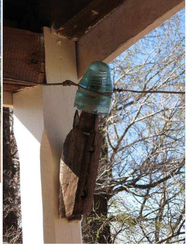
CD133 [230] Used on the Original Deseret Telegraph Line