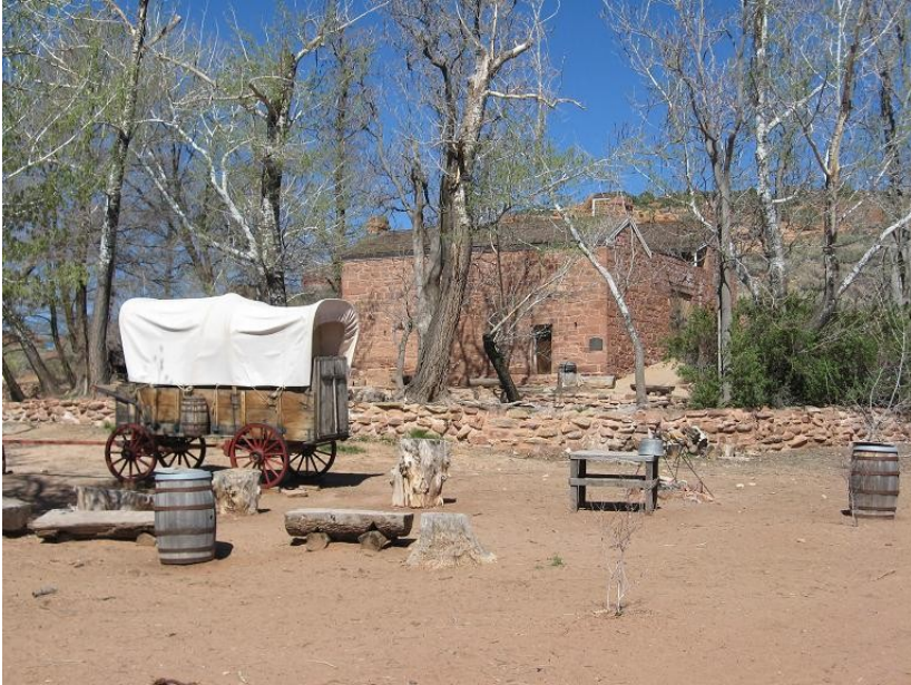
Original Pipe Springs Fortified Building