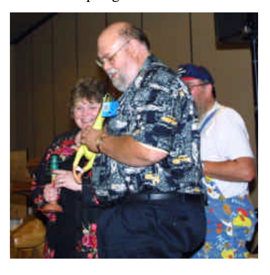
2003 Springfield Ohio National