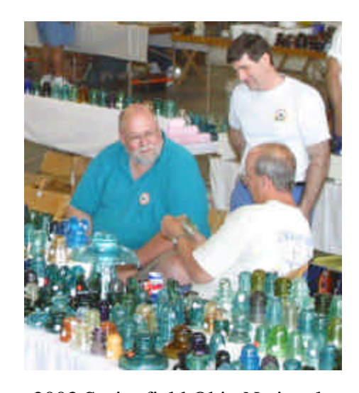
2003 Springfield Ohio National