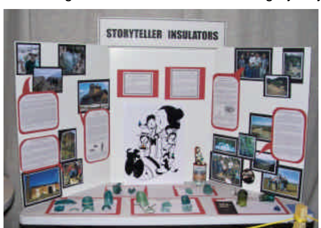
Lynda Katonak's Marvelous Storyteller Insulator Exhibit

outstanding again this year. This is always one of the high points of the show. There were ten displays covering many aspects of the hobby. Four of the exhibits were insulator related, three were displays of bottles, one was both an insulator and bottle exhibit, and the remaining two fell into the "other" Category. Lynda Katonak walked