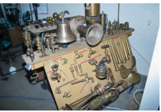
The Magnificent Brass Exhibit - Jack Newbold