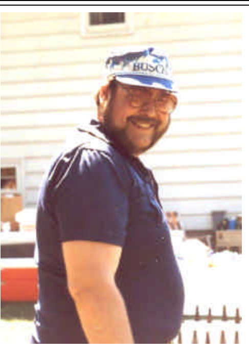
1990 Capital District Insulator Club Swap Meet & Picnic