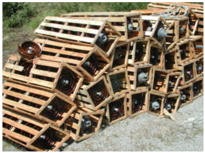
Suspensions Out of Service in Newfoundland

landing site of early explorers of North America. While the coastline has many picturesque fishing villages along the way, the interior is quite mountainous and is mostly uninhabited. The mountains here are actually the northernmost extension of the Appalachians.