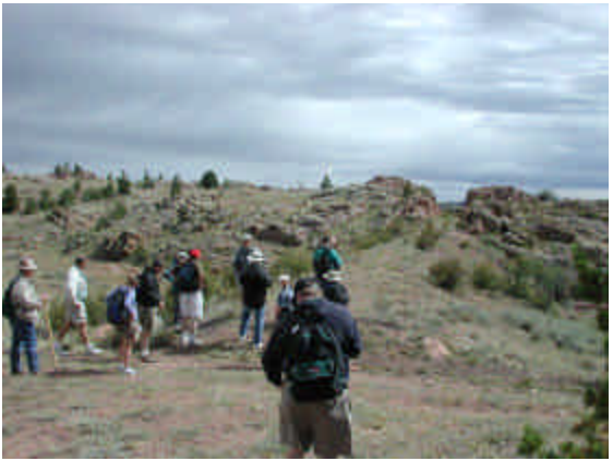
Old Grade of the Transcontinental Railroad

Next year, the NIA Western Region will host the National Show (San Jose, 7-10 July), so there won't be a separate WR show. I believe the tables for the 2005 National are already sold out.