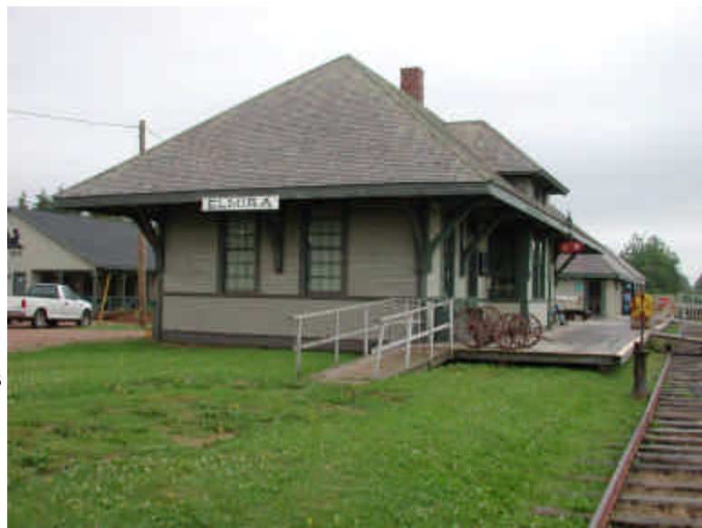
Elmira Station on Prince Edward Island

From PEI, we cut north along the beautiful coastline of New Brunswick on up to Quebec and the famous Gaspe Peninsula. This rugged protrusion on the south side of the St. Lawrence Seaway sticks well out into the Gulf of St. Lawrence and the point at the end was the