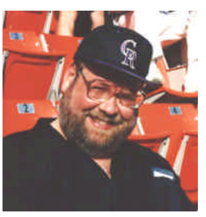
1993 Denver National