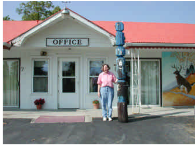
50's Motel in Leon Iowa

The drive from Bancroft through Sudbury to Sault St. Marie was scenic, but the constant rain was a nuisance. We had a fine excursion through the famous Sault locks just at dusk. If you haven't been to this historic site, it is well worth the visit.