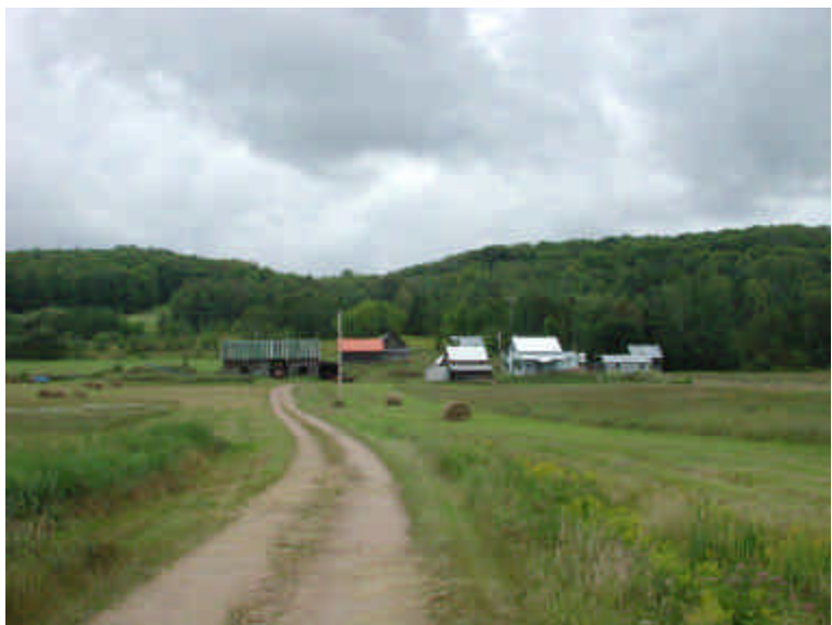
The Junop Farm in Ontario Nice and green.