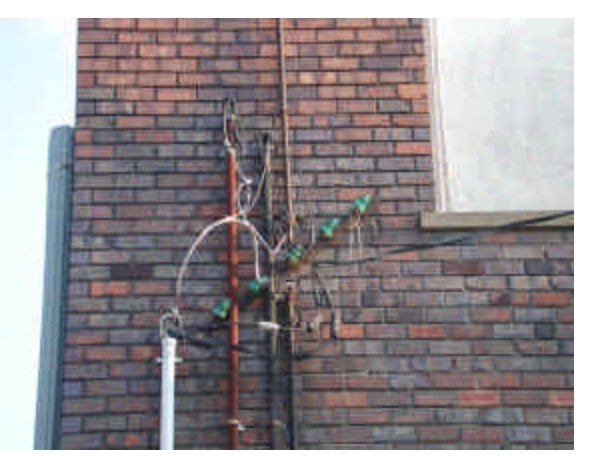
Glass on the Walls - Leon Iowa

And finally...it was over! Home at last to an overgrown jungle – and a month's worth of work to do before leaving for the Denver Western Regional show the next week!