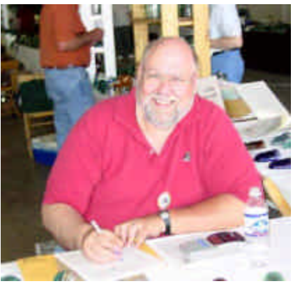
2003 Springfield Ohio National