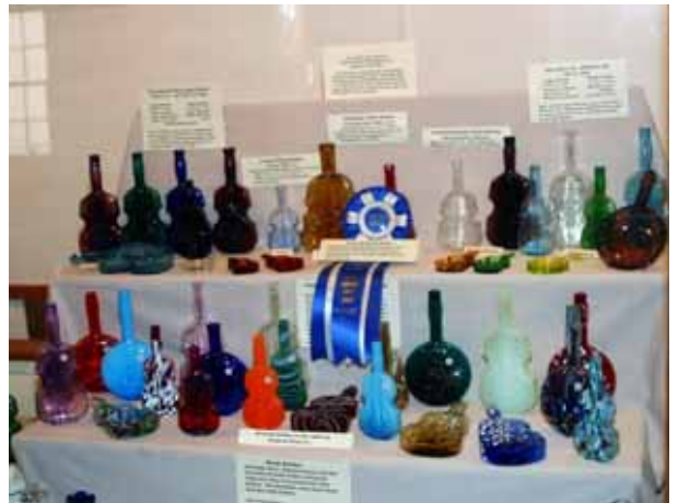
This years peoples choice winning display of Violin & Banjo Bottles.