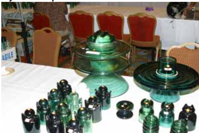
Very large Multi-part Glass insulator (French Design) brought to the show by Bernie Warren.