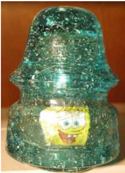
Weird junk-in-glass insulator