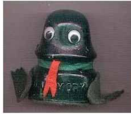
Brookfrog insulator (not related to Guardfrog)