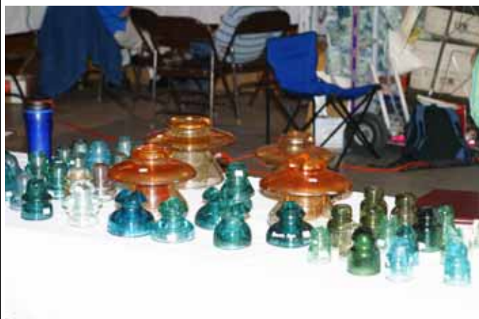
Some colorful Carnival Power pieces up for sale.