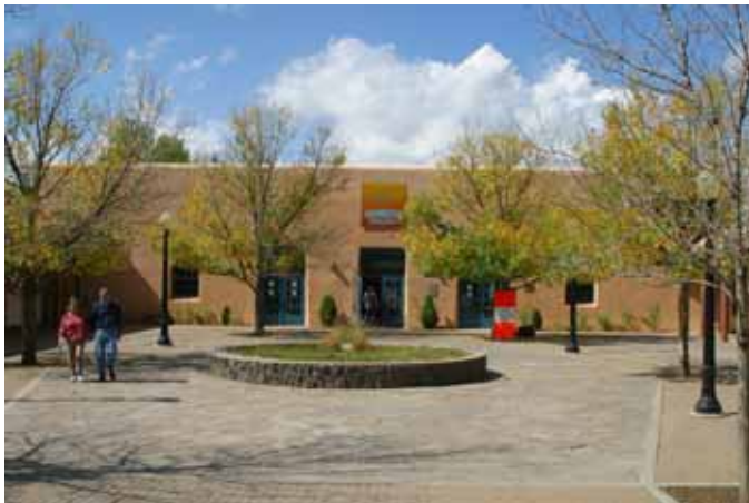
The show was held at the Bolack building on the New Mexico State Fair grounds.

The weather was great for the show, but not so great for the Balloon Fiesta. Winds kept the balloons grounded Saturday morning. It sounds like next year the show will be held before the balloon fiesta, which would be a good thing because it will be easier to get a motel room (and cheaper too).