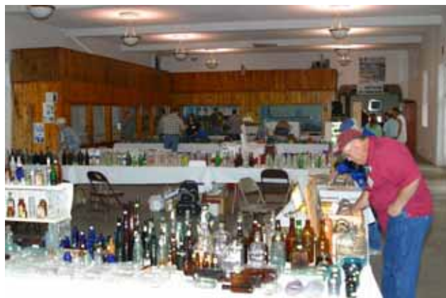
One of two separate areas of the show hall holding approximately 45 tables. Plenty to see for all in attendance