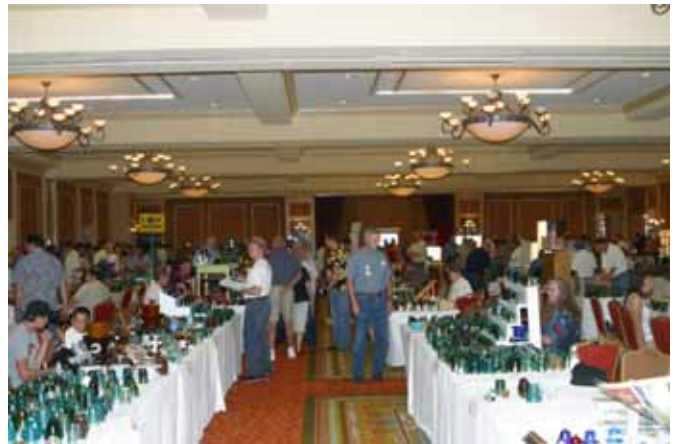
Partial show hall picture, Austin National 2006