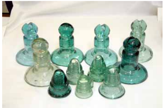
A seldom seen set of Chambers Insulators. All these pieces were used in Chambers lightning rod systems and were made by Hemingray. The entire set was for sale.