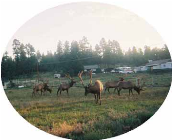
The elk are in the area to the west of the house. They do a good job of mowing the yard, but leave their calling cards that have to be swept up!

In the house there are a number of sun colored bottles and door knobs. Above the freezer in the pantry there is a glass curtain to capture the light from the setting sun. It is made up of colorful antenna strains and glass curtain rings from long ago.