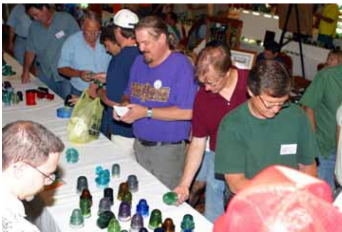
New glass being put out always attracts a "feeding frenzy".