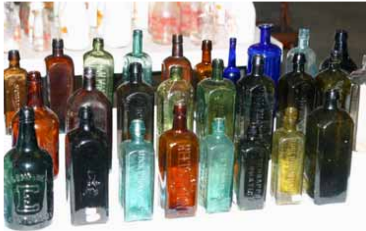
The show always has something for the bottle collector. The show is actually nearly 50/50 insulators and bottles with some other thrown in items as well.