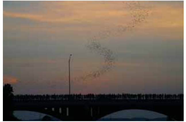
Millions of Mexican free tail bats leaving an Austin bridge to feed. This is a daily occurrence this time of year and there are "bat cruises" up and down the river.