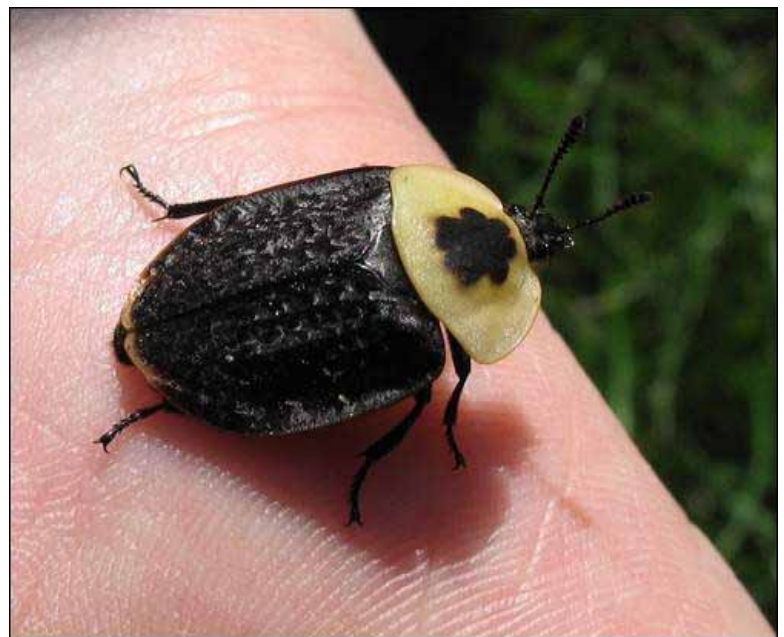
Insulator Bug (looks like a porcelain multipart insulator on the yellow part of the shell) (no, there's no image of the Virgin Mary)