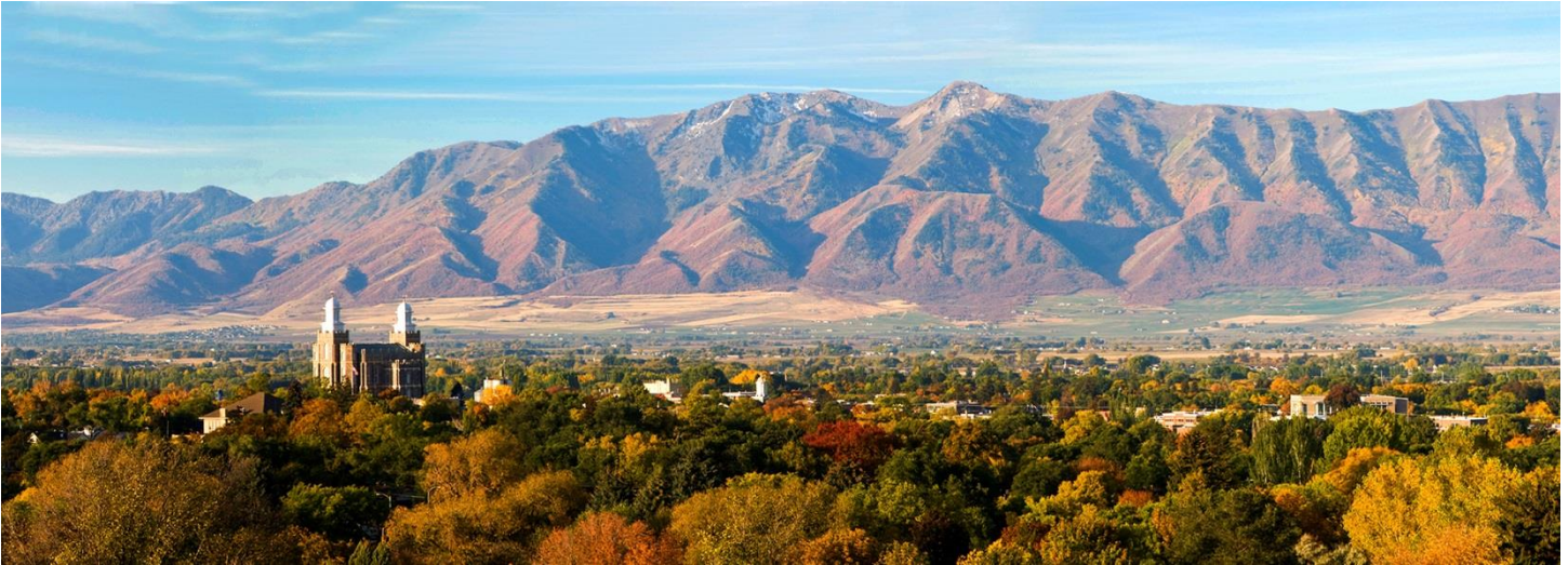
Autumn in Cache Valley

The 2020 NIA National Show & Convention will be held on June 12 th - 14 th in Logan, Utah. Logan is a small city in Cache Valley, a mountain valley located in the heart of the Rocky Mountains. It's an easy 90 minute drive from Salt Lake City's International Airport. The beautiful agricultural valley is nestled between two majestic mountain ranges and home to Utah State University. Logan is surrounded by several bedroom communities and is a slice of Americana that is like a step back in time. The pace is a little slower with many options for things to do. Attendees and their families can stay as busy or relaxed as they choose. Attendees can easily turn this show into a fantastic summer vacation. In addition to the multitude of things to do in the local area, Cache Valley is only a 4 hour drive to Yellowstone & Teton National Parks and about a 4-5 hour drive to most of Southern Utah's National Parks.