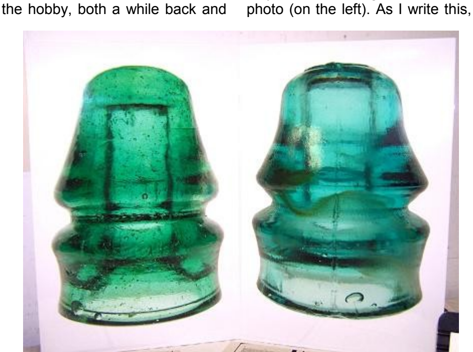
Two CD 731s as shown on Rick Jones' display

First, I saw a very strange threadless on a dealer's table, similar to a tall CD 735. I have not seen this item before, nor anything similar